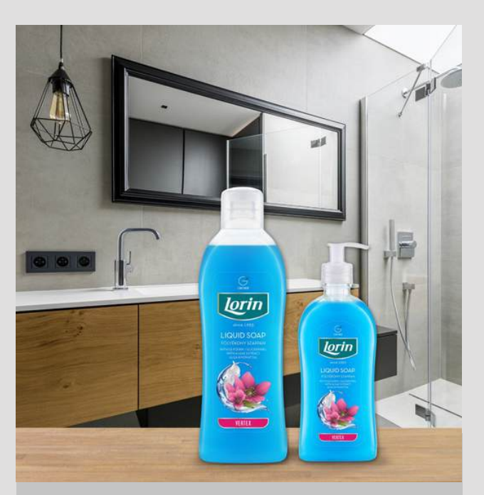
Lorin Vertex liquid soap

Infused with the essence of almonds, this liquid soap gently cleanses while deeply moisturizing the skin. Its luxurious lather leaves your hands feeling soft, supple, and delicately scented with the warm, comforting aroma of almonds. Ideal for daily use, Lorin Almond Liquid Soap is a treat for the skin, providing hydration and care with every wash.