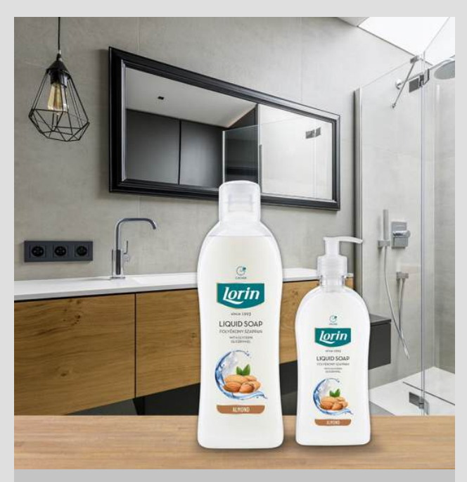
Lorin Almond liquid soap

Its mild, pleasing fragrance leaves hands feeling refreshed and lightly scented, making it a delightful addition to any bathroom. Choose Lorin Liquid Soap for a clean, nourishing, and luxurious handwashing experience.